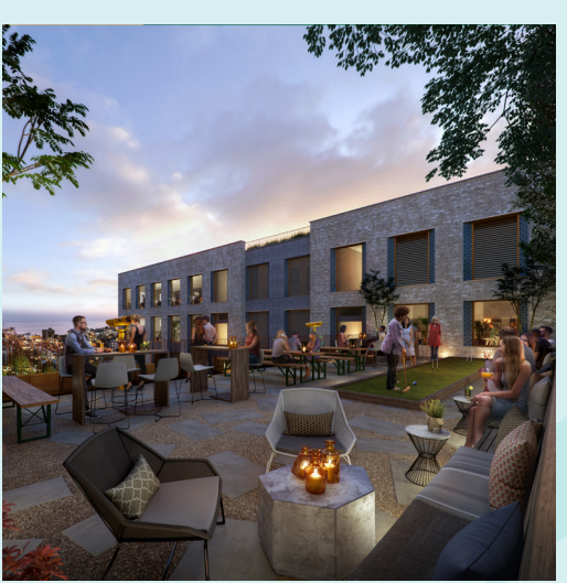
Edward Street Quarter, Brighton

This was the case in our very first development in Hackney, where we delivered sustainable homes for key workers and local people alongside affordable workspace for entrepreneurs and start-ups.